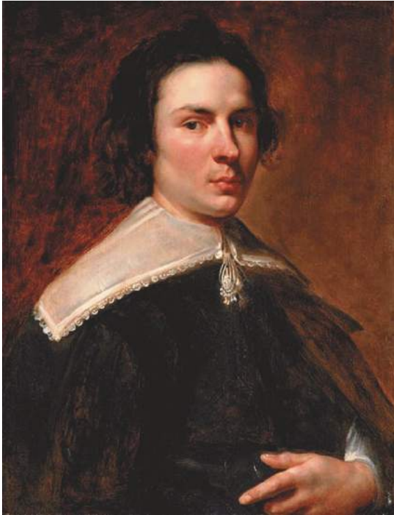
20. Attributed to Jan Cossiers, Portrait of a Young Man, private collection.