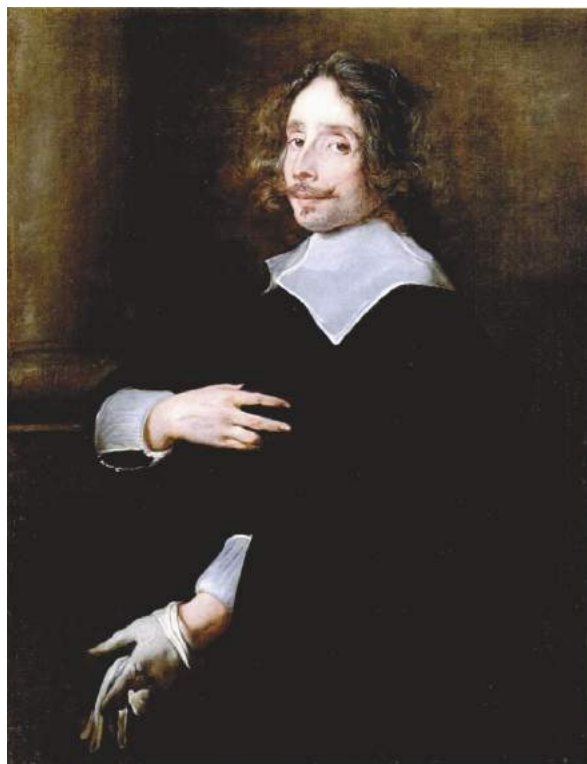
9 Jan Cossiers, Portrait of a Young Man , ca. 1650, Detroit Institute of Arts , no. 79.14. Fot. Detroit Institute of Arts , after: Julius S. Held, Flemish and German Paintings of the 17th Century: The Collections of The Detroit Institute of Arts, Detroit 1982, plate II, p. 18

a Man in Worcester Art Gallery may need to be reconsidered – it surely requires some new research that could lead to a more definitive conclusion about its possible authorship.