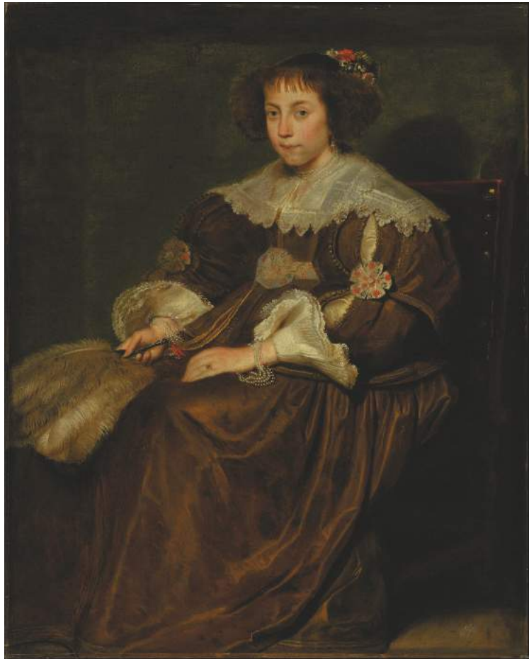
4. Cornelis de Vos, Portrait of a Young Woman, c. 1635, Metropolitan Museum of Art in New York, inv. 71.46.