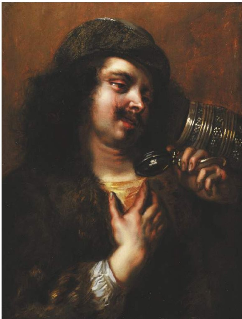
19. Attributed to Jan Cossiers, A Man Holding a Tankard, private collection.

to Jacob Jordaens, 52 which was repeated in the later twentieth-century publications, although this was questioned by some experts on the basis of stylistic analysis. 53 Recently the painting was tentatively attributed to Cossiers („possibly Jan Cossiers”), 54 which seems to be convincing. It should be noted though that Cossiers was proposed as a possi-