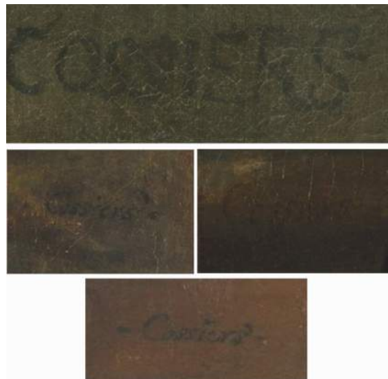
8. Comparison of the signature from the Portrait of a Surgeon (at the top) with the signatures of Jan Cossiers from his other paintings