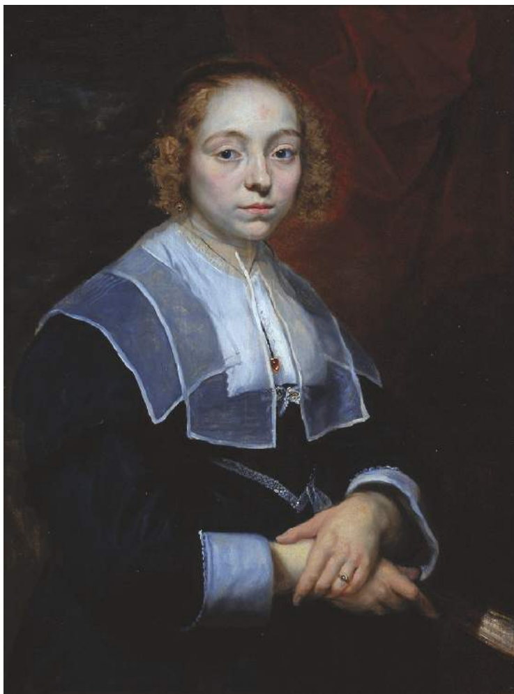
1. Portrait of a Lady in York Art Gallery (YORAG 840).

sold in 1929 (and subsequently demolished), the painting was purchased by the dealer David Croal Thomson at Christie's in London, on 17th May 1928 (lot 72). In 1953 the portrait was purchased by F.D. Lycett Green at Agnew's in London; in 1955 Lycett Green gave it through the National Art Collections Fund to the then City Art Gallery in York. 3 The painting was exhibited at the Royal Academy in London in 1887, 4 1953 5 and 1962, 6 each time as by Cornelis de Vos.