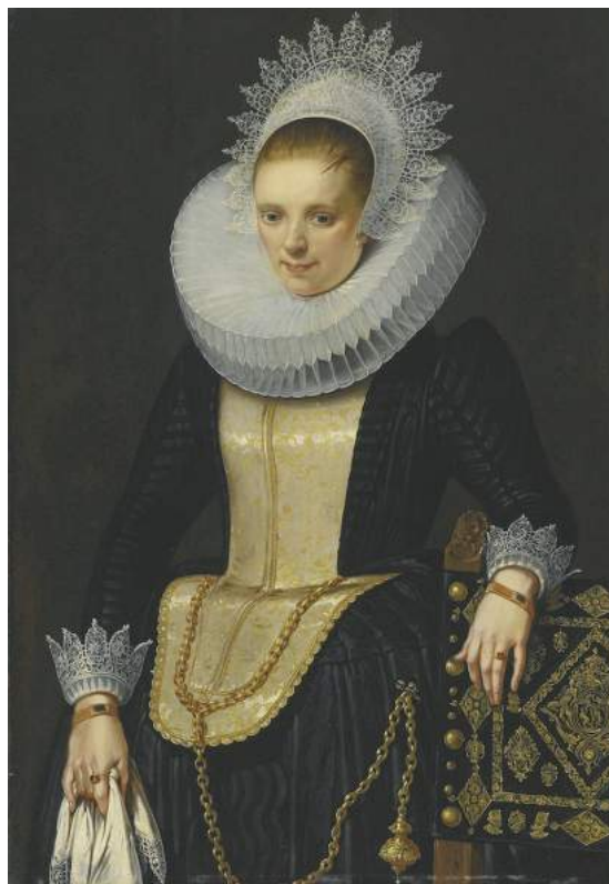
3. Cornelis de Vos, Portrait of a Lady in Elegant Dress, 1620's, private collection.