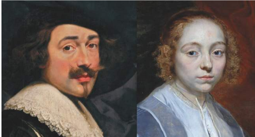
17. Comparison of the details of Portrait of a Man in a Wide-Brimmed Hat in National Gallery of Art in Washington and Portrait of a Lady in York Art Gallery