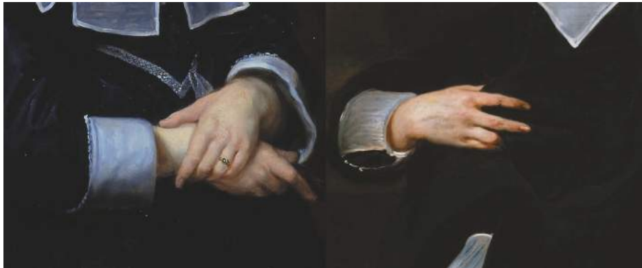
11 Comparison of the details of Portrait of a Lady in York Art Gallery and Jan Cossiers' Portrait of a Young Man in Detroit Institute of Arts

measuring 97.0 by 75.8 cm. The portrait is signed «Cossiers F.» at the base of a column to the left of the figure. The signature was discovered when the painting was cleaned in 1979 41 – before that it was attributed to Anthony van Dyck. 42 In fact, the attribution to van Dyck was not just traditional, but supported by experts in the early twentieth century. 43 This is understandable as the artistic quality of this painting is very high indeed, and the composition is consistent with van Dyck's portraiture as well. Nevertheless, the painting differs in some aspects from van Dyck's autograph work: dark in palette, with lively brushwork, it seems more sketchily painted overall. The undoubtedly elegant hands of the sitter