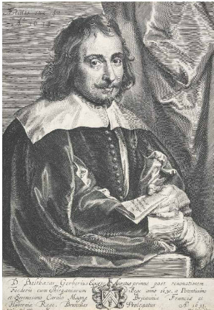
2. Paulus Pontius, Portrait of Balthazar Gerbier (1634), after Anthony van Dyck.

faces the spectator. Her head is uncovered, so she seems to be unmarried; her blonde hair is arranged in a way typical for the best part of the seventeenth century: flattened at the top, and curled on each side of the face. She is wearing a wide, dark blue dress with long puffy sleeves. Her collar and sleeve linings are white and decorated with lace trim. The collar is especially interesting, as it is made of several semi-transparent layers, covering the lady's arms and chest. This kind of dress was especially popular around the late 1630s and early 1640s – for example, it was depicted repeatedly in paintings by Frans Hals (e.g., Portrait of a Woman with a Fan , c. 1640 in the National Gallery, London 7 ; Maria Pietersdochter Olycan , dated 1638, in the Museu de Arte de São Paulo 8 ; and A Dutch Lady , c. 1643-45, in the National Gallery of Scotland, Edinburgh 9 ), as well as by the other artists (e.g., Portrait of a Woman , dated 1640, by Johannes Cornelisz. Verspronck, Rijksmuseum Twenthe, Enschede; 10 or Portrait of a Lady in Black Satin with a Fan by Bartholomeus van der Helst, dated 1644, National Gallery, London 11 ). Most of the examples of such dresses are