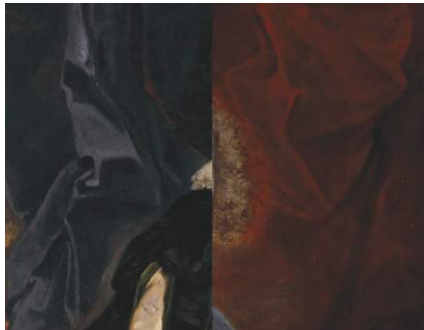
18. Comparison of the details of Portrait of a Man in a Wide-Brimmed Hat in National Gallery of Art in Washington and Portrait of a Lady in York Art Gallery

A Portrait of a Man in a Wide-Brimmed Hat , painted on panel (fig.16), is in the National Gallery of Art, Washington, D.C. 49 A rather young man is depicted in a three-quarter length composition, turned right but looking at the spectator, with a blue curtain in the background and a glimpse of landscape behind it. The painting was traditionally attributed at first to Velázquez, 50 and subsequently to Rubens. 51 In 1968 the attribution was changed