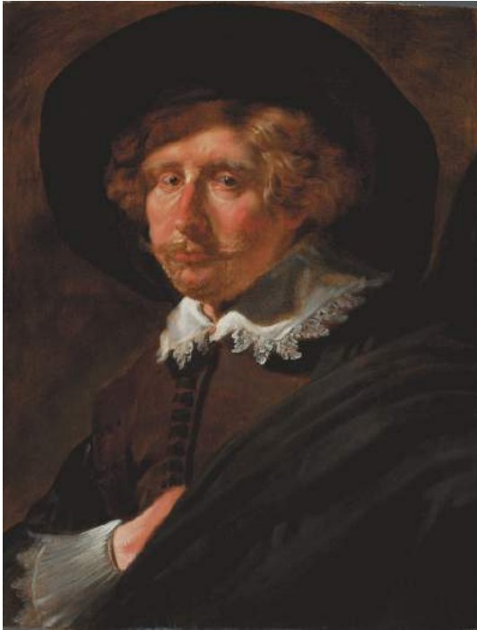
6. Portrait of a Man attributed to Jan Cossiers, Worcester Art Museum, no. 1983.37.