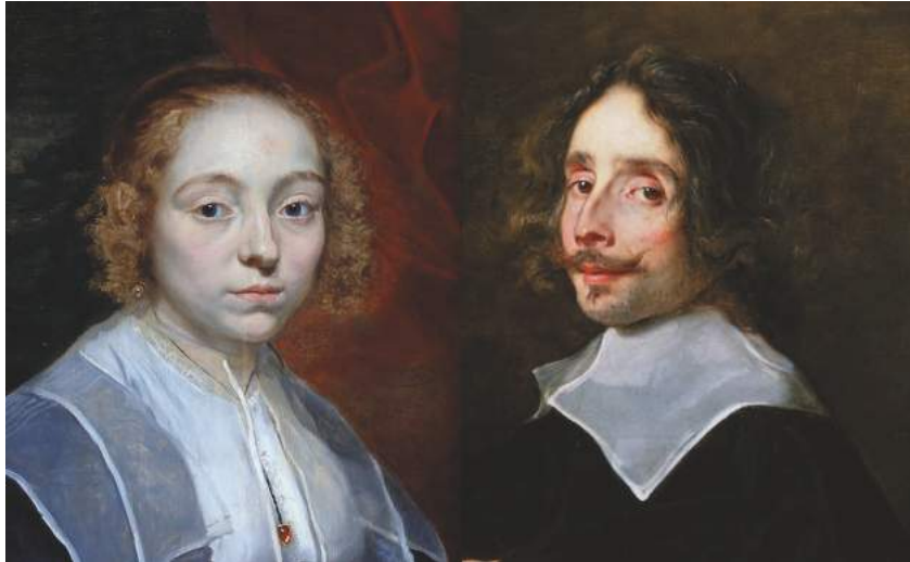
10. Comparison of the details of Portrait of a Lady in York Art Gallery and Jan Cossiers' Portrait of a Young Man in Detroit Institute of Arts