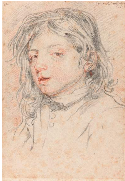
14 Jan Cossiers, Portrait of Cornelis Cossiers, drawing, 1658, Amsterdam, Rijksmuseum, inv. RP-T-2008-103.