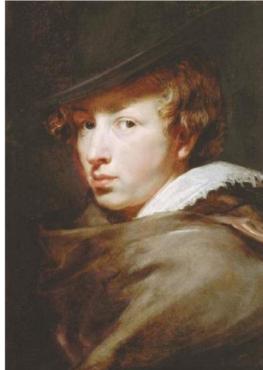
21. Attributed to A. van Dyck (?), Portrait of Young Van Dyck, ca. 1617, Rubens House (Rubenshuis) in Antwerp.