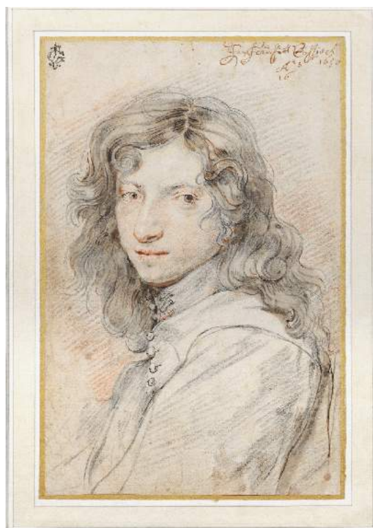
12 Jan Cossiers, Portrait of Jan Frans Cossiers, drawing, 1658, Paris, Fondation Custodia, Collection Frits Lugt, inv. 1367.

would probably be slimmer and with longer fingers if they had been painted by van Dyck. It seems that Cossiers accentuated the expression of the sitter's face by executing the features more carefully and framing it with more freely painted areas, such as the background, hair and clothes. The sitter's pale complexion is modelled by bluish shadows (especially around the chin) as well as by pinkish blushes and spots in the inner corners of the eyes – it seems in many ways close to the Portrait of a Lady in York (fig. 10). There are some differences between the two portraits – the paint layers in the portrait in York seem a bit thicker and brush strokes perhaps more visible – but they may still have been created by the same artist. They most likely come from different times of his life (the Detroit painting has been dated to c. 1650), which may be reflected in the change of palette. Also, the York painting is on panel, while the Detroit one is on canvas. Nevertheless, both portraits contain very similar elements, e.g. the execution of the sitters' hands (fig.11), and most of all it should be stressed that both portraits are highly expressive and psychological, managing to capture the sitters' individual character.