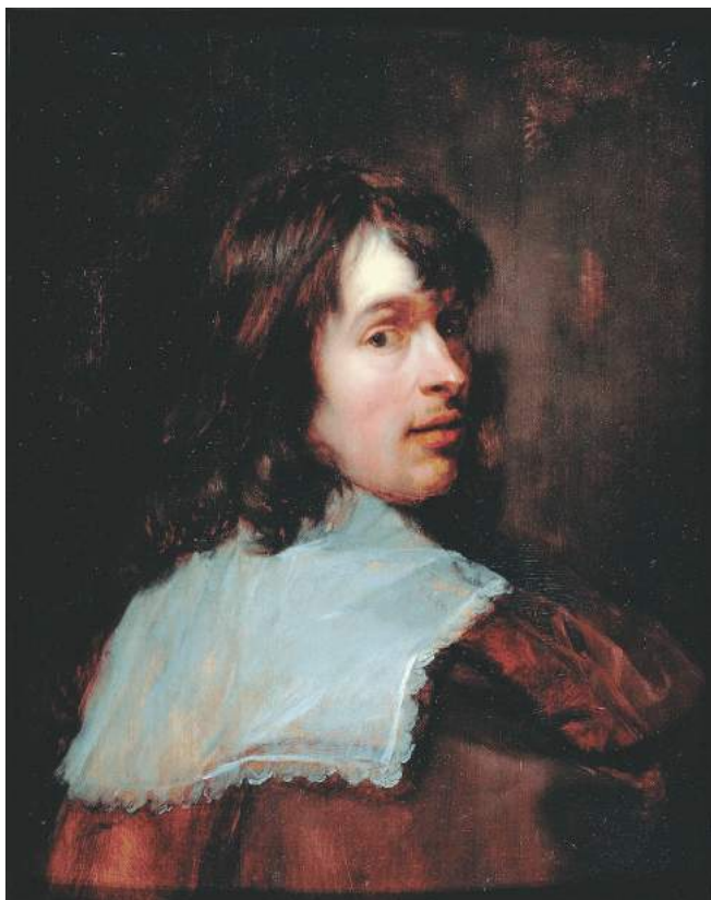
5. Dutch or Flemish School, Self-portrait?, Dulwich Picture Gallery in London, DPG605.

The oeuvre of individual portraits by Cossiers is not very extensive: it consists of some drawings (including five depictions of his sons), a signed oil portrait in Detroit Institute of Arts, and a few attributed works. It seems worth mentioning that some attributions to Jan Cossiers need to be revised and perhaps should be rejected. There is an unfinished portrait of a young man at Dulwich Picture Gallery, London, 31 which was attributed to Cossiers, 32 although recently this has been questioned (fig. 5). The new catalogue of Dutch and Flemish art in Dulwich revised the attribution; for now the Dulwich portrait is described as non-attributed, Dutch or Flemish School. 33